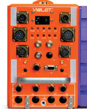
Violet Edge 820