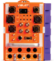
Violet Edge 830